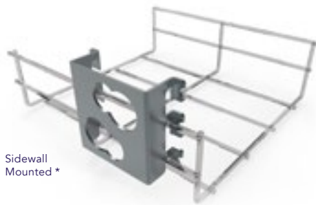
Sidewall Mounted *

Suitable for \varnothing 20 & \varnothing 25 conduit