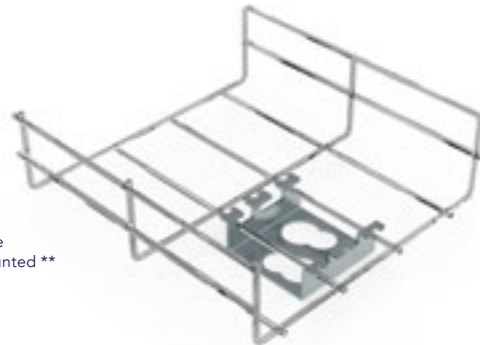
Base Mounted **